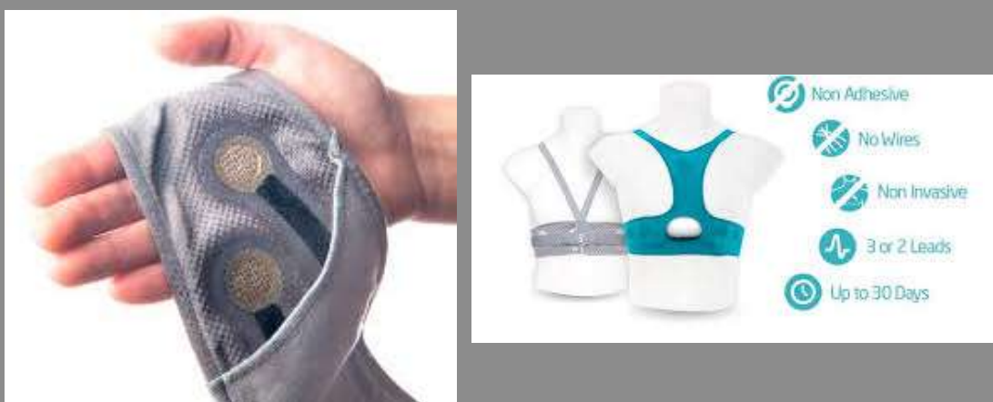
Figure 3 - NUUBO wearable ECG unit