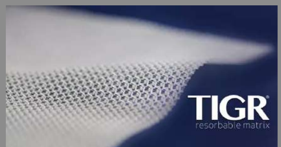
Figure 9 - TIGR Matrix- resorbable matrix which reconstruct the breast tissue after cancer

Different designs (e.g., woven, knitted, and bioprinted) provide specific structural and mechanical properties for the scaffolds, which are appropriate for tissue regeneration or replacement.