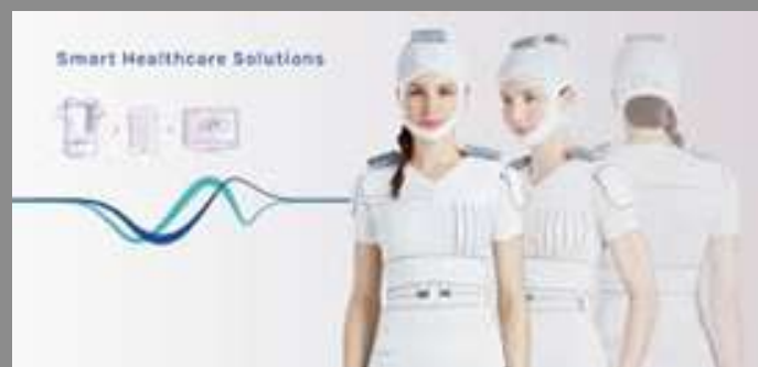
Figure 1 - Bioserenity - Ambulatory mobile solutions for the diagnosis and monitoring of patients

These sensors are positioned to obtain the required biosignals continuously to diagnose, analyze and give the posology adapted to the patient. Again, one of the benefits of this development is conserving the comfort of traditional textiles cloths, which improves the quality of the collected data.