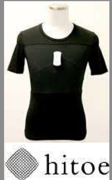
Figure 2 - Hitoe™ bio-electrode conductive nanofiber fabric

Likewise, Nuubo 12 is a wearable medical technology company which offers e-textile technology BlendFix sensor electrodes, for remote ECG monitoring with a cost-effective, simple, transparent and non-intrusive method.