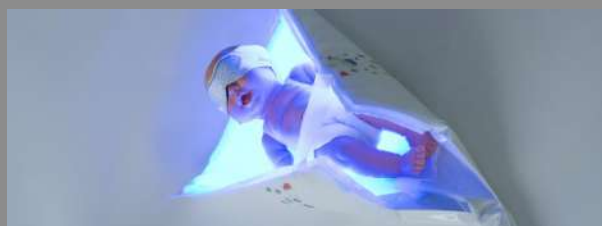
Figure 7 - NeoMedLight - medical devices for phototherapy for treating neonatal jaundice

The flexibility of the device gives the possibility to adapt patient morphology which makes the light emission more homogeneous, where the light emission power was less necessary so the pain of the treatment. 55 The portability of the device gives the possibility to decrease the costs of the treatment and treat more patients in the same time. Furthermore, this development is applicable in many different treatments like for jaundice of new born, fluorescence diagnosis etc.