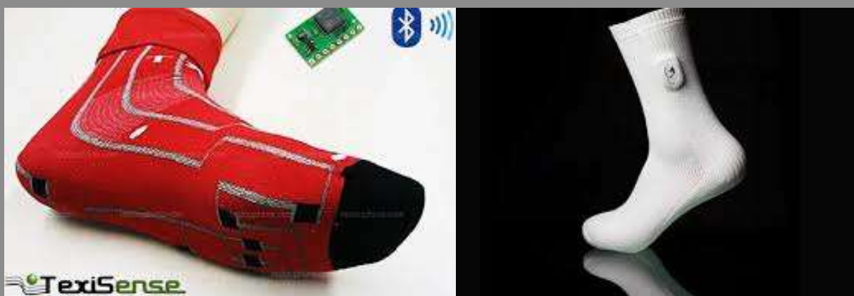
Figure 4 - Taxisense e-socks (on the left) and siren e-socks (on the right)

Smart socks are also a highlight product in smart textiles. Taxisense in collaboration with IFTH has developed smart socks to reduce fall events for patients at risk. These knitted socks with conductive and piezoresistive fibers are designed for daily use and provide the same comfort of regular socks. Furthermore, these smart socks 16 may help prevent diabetic foot ulcers by alerting the wearer when there is so much pressure due to bad posture or bad-fitting shoes, as diabetic patients have reduced nerve functioning. Siren e-socks are also in the market for preventing foot ulceration by monitoring continuously the foot temperature. The monitoring system sends the collected information to the health professional, to help tracking the possible inflammations.