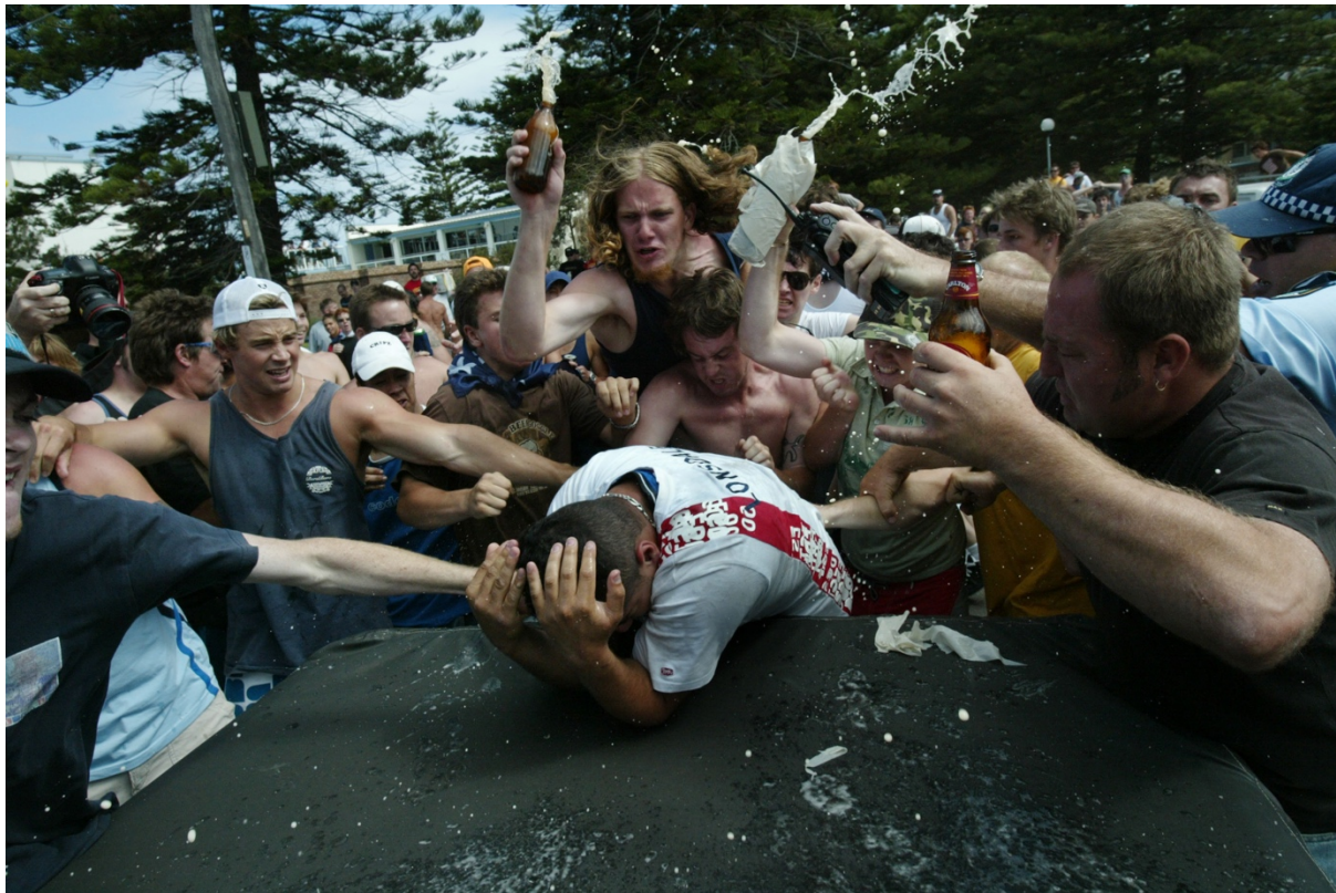
Figure 1: A man is surrounded and bashed at Cronulla Beach on Sunday 11 December 2005.

On Sunday 11 December, over 5000 white Australians responded to the call and descended on Cronulla. In the morning, they cooked BBQs and drank beers in a festive atmosphere resembling Australia Day celebrations held annually throughout the country. By the early afternoon, despite the police and media presence, they had turned into a vicious mob, harassing, chasing and bashing anybody who they perceived to be of Middle Eastern appearance. Many were draped in the national flag and sported racist slogans (“Fuck Off Lebs”, “We Grew Here, You Flew Here”), proudly displayed their white bodies, and chanted their claims of ownership of the beach and the nation. A spate of violent retaliatory attacks and property damage occurred over the following nights, as community leaders called for calm and restraint. The horrific events at Cronulla and their aftermath brought Australia’s simmering racial tensions out into the open, and would have a profound impact on how race relations in the nation are discussed and understood. As the Hazzard report ominously put it, these events “carried with them a clear message to the Australian community that our multicultural society has now entered a new phase of its development” (Strike Force Neil 6).