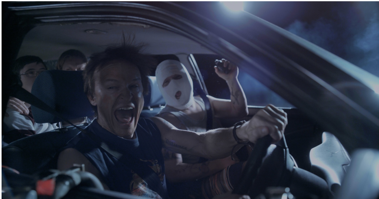
Figure 5: One of the film's slow-motion burnout sequences. Down Under . Studio Canal, 2016.

seating arrangements within the cars are mirrored, with Nick/Jason behind the wheel, D-Mac/Ditch in the passenger seats, and Ibrahim/Evan and Hassim/Shit Stick occupying the back seats. The second and lengthier slow-motion sequence begins with a bird's-eye wide shot of one car leaving a series of circular tyre marks as it spins around, while the second car orbits around the first. The circular imagery recalls an earlier scene involving the opposite group, whereby the camera performs 360-degree pans in the middle of the car as the men inside argue. These accented examples of film style have a clear narrative and thematic function, emphasising the macho subcultures to which both groups of men belong, as well as providing an ironic commentary on these subcultures. Moreover, through their pairing they also reinforce a perpetual impression of symmetry that is felt as much as it is understood.