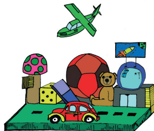
Miljan, 16 years old, Croatia