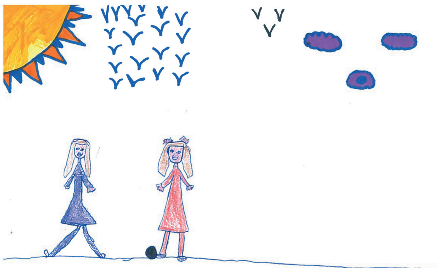
Rebecca, 8 years old, Italy