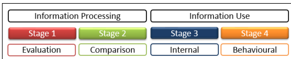
Figure 1. Information Processing and Use