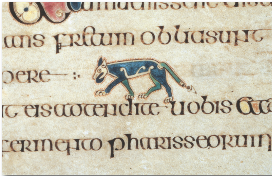
Pl. 17—The wolf from f. 76v of the eighth-century Book of Kells in the Library of Trinity College, Dublin.

Discomfort aside, I should think that anyone who sleeps with a wolf's head under their pillow is more likely to have nightmares.