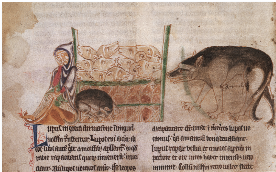
Pl. 16—A wolf approaches a sheep-pen as the shepherd sleeps in this illustration from a thirteenth-century bestiary.

countries in Eastern Europe, for example, where there remains a significant wolf population and therefore a continuing threat to the domestic animals (Pl. 16).