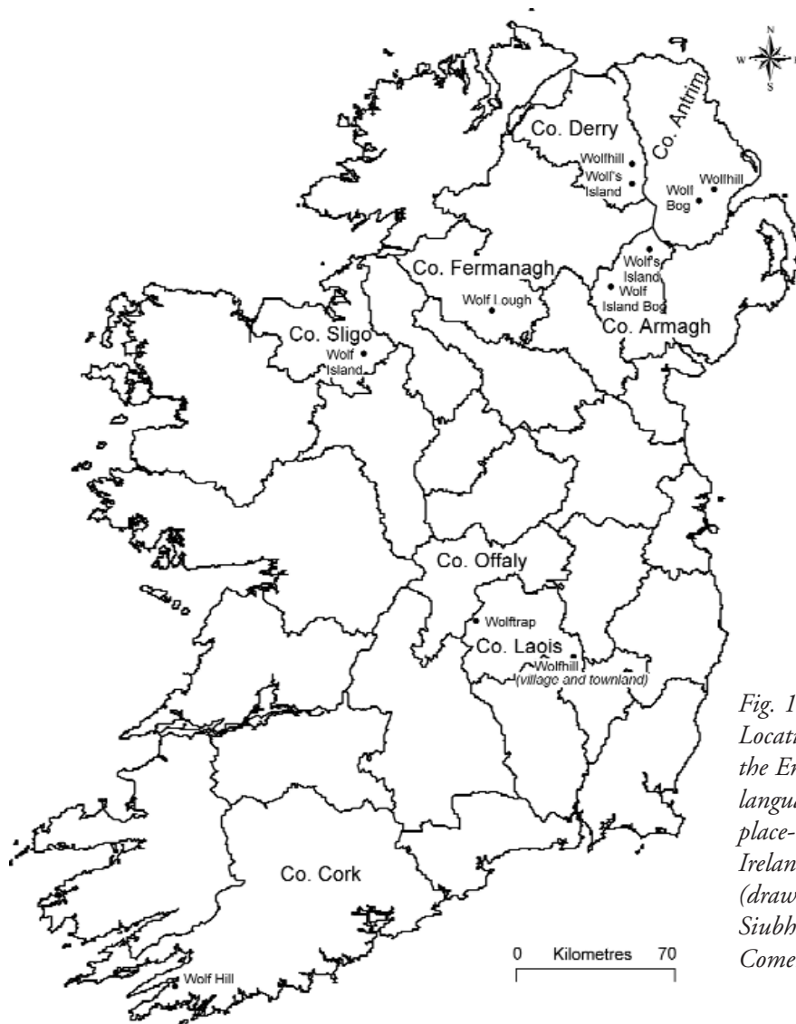
Fig. 1— Location map of the English- language wolf place-names in Ireland (drawing by Dr Siubhán Comer).

A considerable number of place-names in Ireland are associated with wolves. A few of these are in English, e.g. Wolf Island in Lough Gill, Co. Sligo (Fig. 1). The vast majority, however, are 'hidden' in Irish place-names. This is because there are