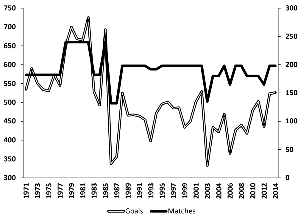
Figure 1: Number of Goals & Matches 1970 – 2014

Interestingly, the highest number of goals in a single season occurred during the 1981-1982 campaign, the same year the points system was altered so that four points were awarded for an away win and two for an away draw. The introduction of the First Division for the 1985-1986 season coincides with a dramatic fall in the number of goals. This is primarily due to the reduction in the number of games. However, an increase in the number of matches from the 1987-1988 season to the 2001-2002 season does not see a return to the number of goals from 1970 to 1977 when a similar number of games per season were played. A reduction in the number of Premier Division teams in 2003, witnesses the lowest number of goals (333) in any season in the sample. This can be explained by the shortened league season, to accommodate the switch to Summer Soccer .