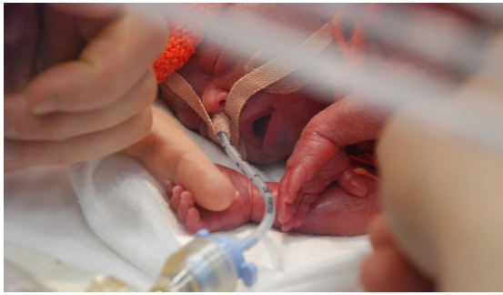
Extremely preterm infant.

tained from the parents of each child before or shortly after delivery. The study was funded by a grant from the Elsass Foundation.