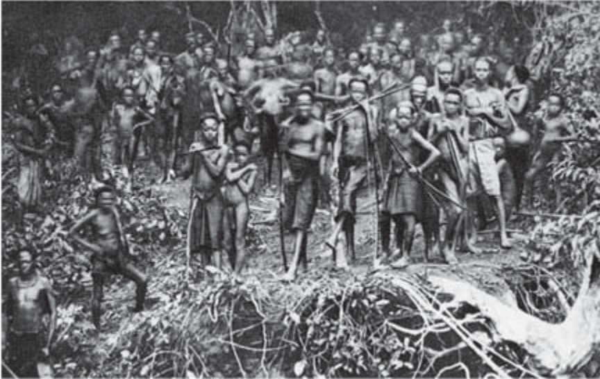
People gathered in the forest, at the passage of Conrad's steamboat "Roi des Belges" ("King of the Belgians") in 1888. From Alexandre Delcommune, Vingt Années de Vie Africaine (Brussels: Ferdinand Larciers, 1922)

"symbol" or image) now in captivity of a machine much larger than the immediacy of the warring ship, the serialized techno-mediatic reproducibility of the racial and racialized other. As the effect of that technical reproduction, the racialized bodies have started to pile up as the effect of tele-techno-mediatic massification of death. From the desiccated heads that Marlow sees to the images of the camps in Night and Fog is only a step.